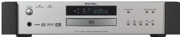
RDV-1092 1080p DVD Player